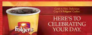
Coffee Window Cling VP40937 24" x 9"

VP40920 Coffee Counter Card 8" x 10" VP41421 Cappuccino Counter Card 8" x 10"