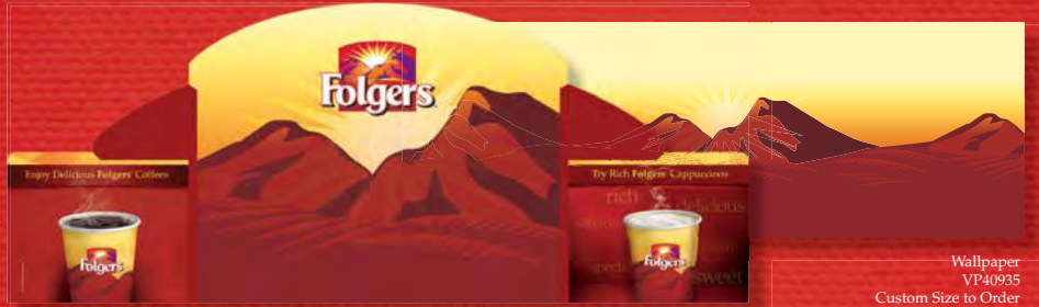
Wallpaper VP40935 Custom Size to Order

Utilize branded merchandising to drive customers into your store and directly to your beverage station.